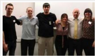
Animal Freedom

In celebration of World Vegan Month , I will be hosting a collection of interviews with vegan abolitionists from across the globe. I'm excited to have this opportunity to showcase vegan activists and give a face to our beautiful movement. Be sure to check back for regular installments throughout the month of November.